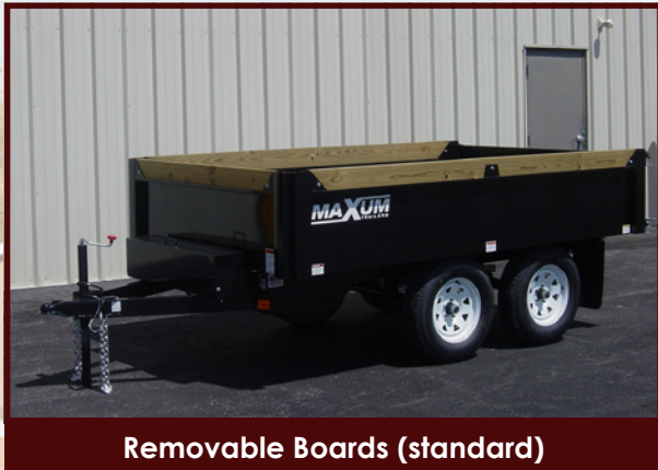
Removable Boards (standard)