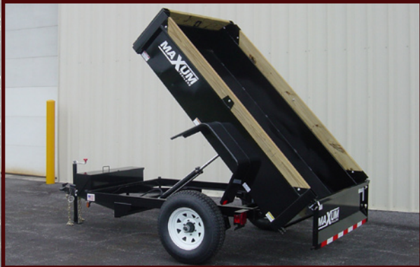
Removable Boards (standard)